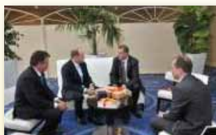
Meetings with your targets