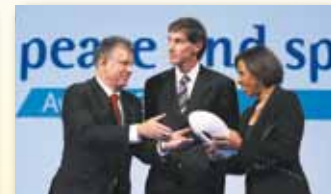
Handle the Awards