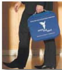
Delegate bag (Goody , brochure)