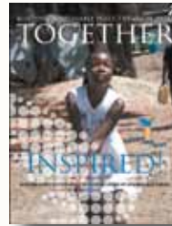
E-zine (45,000 contacts)