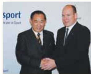
Pictures with VIP