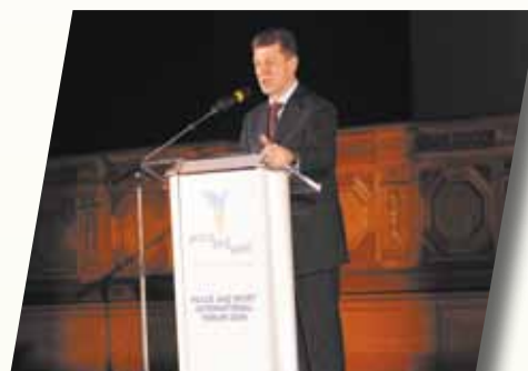
H.E. Mr. Kozak, Deputy Prime Minister of the Russian Federation, announcing that Sochi will be Host City in 2012

Organizing the Forum abroad aims to encourage participation from a diversified public and reinforce international cooperation for sustainable peace.