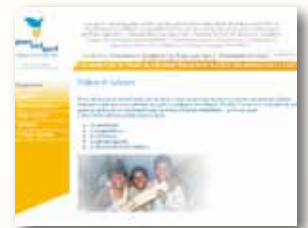
Social networks (Facebook, Twitter)