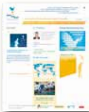
Official website (2,500 visits per day)