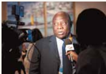
Interviews with accredited media