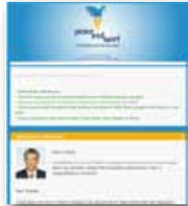
Newsletter (10,000 contacts)