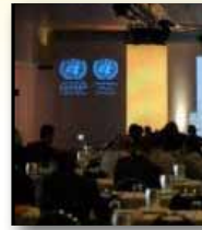
Conference room backdrops